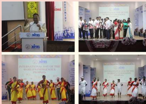
Celebrations during the International Day of the World's Indigenous Peoples

Theme: "Protecting the Rights of Indigenous Peoples in Voluntary Isolation and Initial Contact."