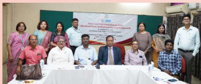
Participants during the Focus Group Discussion Workshop on Jharkhand State Institutional Ranking Framework

https://xiss.ac.in/readmore/xiss-organised-a-fgd-workshop-on-jsirf