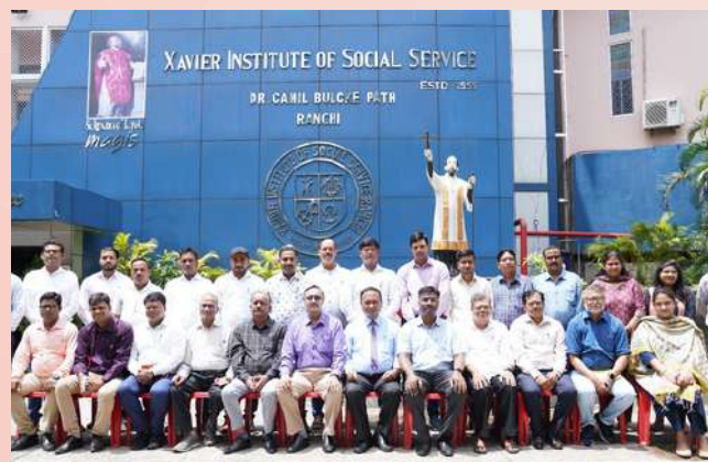
Group Photo of the BRMMC participants

The sessions highlighted the importance of integrating academic and legal theories with practical knowledge and ground realities faced by executives. Sessions were conducted for the first CNT Act 1908 & its implications for Land Acquisition and Coal Bearing Areas (Acquisition & Development) Act 1957 followed by sessions on Land Acquisition Act 1894 & 2013 & Indian Forest Act 1927 and others.