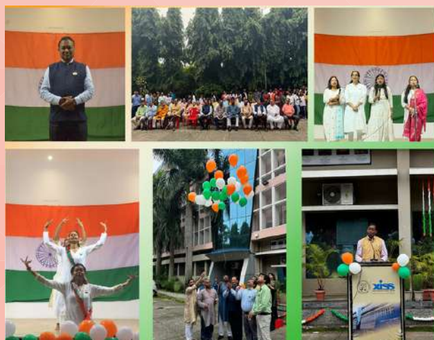
Cultural events during the 78th Independence Day celebrations

XISS, Ranchi, celebrated the 78th Independence Day amidst pride and joy. The event commenced with the hoisting of the Tricolour by Director, XISS followed by the National Anthem to set the spirit of the day. Faculty, staff, and students attended the event and celebrated the day.