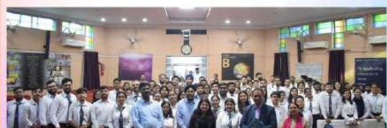
UBER President & Branch International MD interacting with students