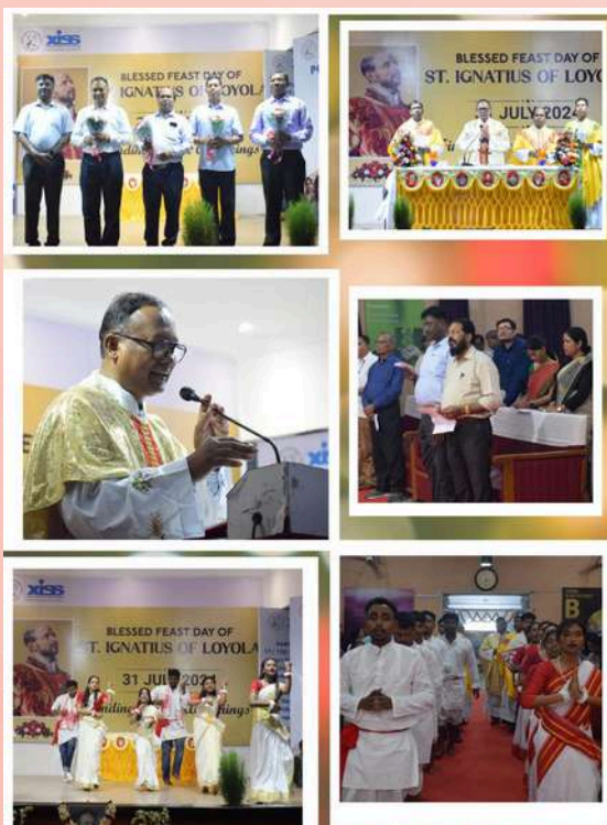
Feast of St Ignatius of Loyola celebrations

https://xiss.ac.in/news/xiss-commemorates-feast-of-st-ignatius-of-loyola-with-special-celebration