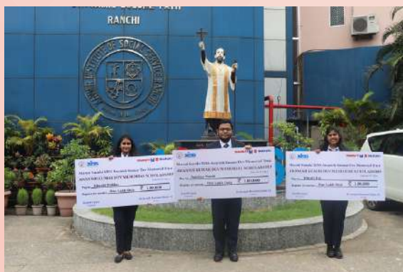
Maruti Suzuki XISS Awanish Kumar Dev Memorial Scholarship awardees