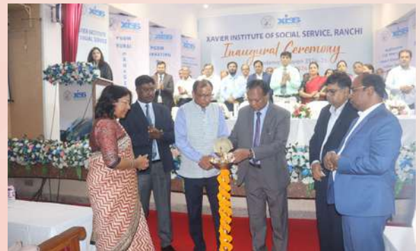
Lighting of Lamp during the inauguration ceremony

In the sessions held later, parents of the newly admitted students interacted with the management followed by sessions on Constitution of India, Importance of Environment and Sustainability, Introduction to the Jesuits: The founder and characteristics of Jesuits Education. The following days also saw different sessions on the Committees of XISS such as SC/ST Committee, Internal Complaint Committee, Anti-Ragging Committee, Counselling Services and Student’s Grievance Redressal Committee which are to support them. Introduction to SWAYAM courses, session by the Alumni Association of XISS (AAXISS) Library and the ERP system were also held. Concluding the orientation session, all Student’s Clubs of XISS introduced the clubs to the new incumbents.