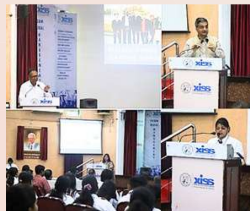
Talk on Combating Structural Violence for a Peaceful Future