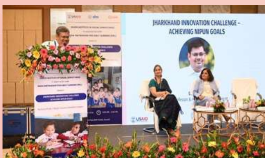
Speakers during the CSR Conclave: Jharkhand Innovation Challenges, Achieving NIPUN Goals

Xavier Institute of Social Service (XISS), Ranchi, in collaboration with the India Partnership for Early Learning (IPEL), organized a conclave titled "Jharkhand Innovation Challenges: Achieving NIPUN Goals" on September 12, 2024, at BNR Chanakya, Ranchi. The event was part of a USAID-supported initiative implemented by CARE USA and KPMG India. The conclave aimed to revolutionize education in Jharkhand by promoting innovative solutions for foundational literacy and numeracy (FLN). It brought together CSR leaders, government representatives, implementers, and visionary CSOs to exchange ideas, build partnerships, and explore groundbreaking solutions for FLN challenges. The conclave offered a platform for selected organizations to present their innovative approaches, creating a significant impact on the children of Jharkhand.