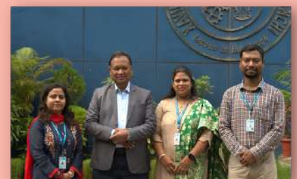
XISS Bulletin Team