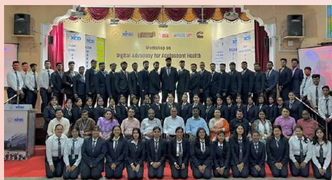
Participants of the Workshop on Adolescent Reproductive and Sexual Health and Digital Advocacy

Head, Rural Management Programme, emphasized the need for advocacy in reproductive and sexual health and hygiene, focusing on curative, preventive, and promotive healthcare. PFI Team discussed the uses of Snehai, a tool to empower and protect adolescents, and engaged students in activities to raise awareness about ARSH. The workshop also addressed conception, contraception, and the Rashtriya Kishori Swasthya Karyakram, detailing its objectives and implementation.