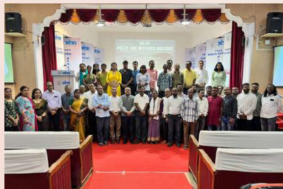
Participants of the One-Day Policy and Research Dialogue

https://xiss.ac.in/news/xiss-tiss-fes-jointly-organized-a-one-day-policy-and-research-dialogue