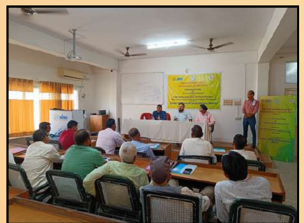
EDP department of XISS successfully completed a 5-day residential training program on Entrepreneurship and Business Development for LAMS/PACS Members and Representatives of Garhwa District, sponsored by SIDHKOFED ON 13 September 2024.

Director XISS was an expert speaker in an Insight Series: Religious Conversion and Indigenous Identity: The Context of Oraons in Chotanagpur organized by Humanities and Social Sciences, IIT Gandhinagar on 23 September 2024.