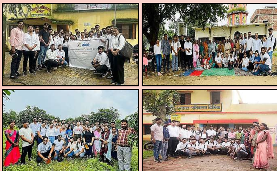
Students of Rural Management Programme during their Institutional Visit