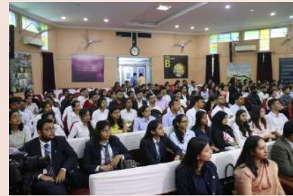
Glimpses from Inauguration Ceremony of New Academic Session of batch 2024-26