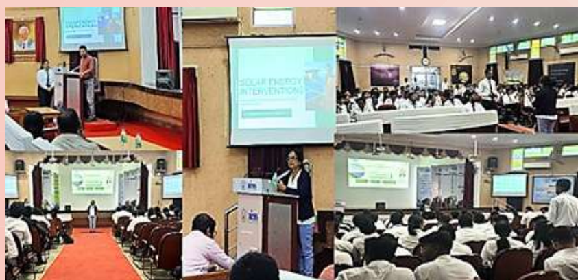
Guest Lecture on Solar Energy Interventions: Scope and Benefits at Farm and Household Levels

On 22 August 2024, the Rural Management Programme organized a guest lecture on the topic "Solar Energy Interventions: Scope and Benefits in its Applications at Farm and Household Levels." The event took place at the Fr Michael Van Den Bogart SJ Auditorium.