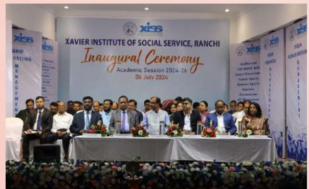
Distinguished guests present during the ceremony