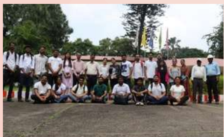
First-Year Students during their Second Institutional Visit