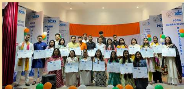
Awardees of the Institutional Scholarship

Three Institutional Scholarships worth Rs 8,10,000 were awarded to 26 students of the Programmes of Marketing Management, Human Resource Management, Rural Management, and Financial Management. These included the Fr Michael Van den Bogaert SJ Memorial Scholarship for meritorious students of SC/ST category (First rank-Rs 50,000 to 4 students, Second rank-Rs 40,000 to 4 students), Fr Michael Albert Windey SJ Memorial Scholarship for meritorious students on the whole, open to all categories (First rank-Rs 30,000 to 5 students, Second rank-Rs 20,000 to students) and Fr Louis Francken SJ Memorial Scholarship (First rank-Rs 30,000 to 4 students, Second rank-Rs 20,000 to 5 students) for overall performance of all categories.