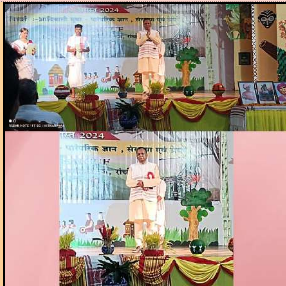
Director, XISS attended the World Indigenous Day celebrations at St Xavier’s College, Ranchi on 9 August 2024.