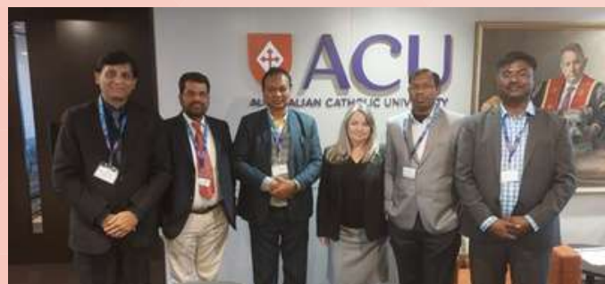
XISS Team during their IAJBS visit