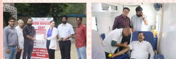
AAXISS, RCSR, & JCI host successful Blood Donation Camp