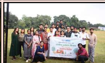
Students of Rural Management Programme during their Rural Field Exposure