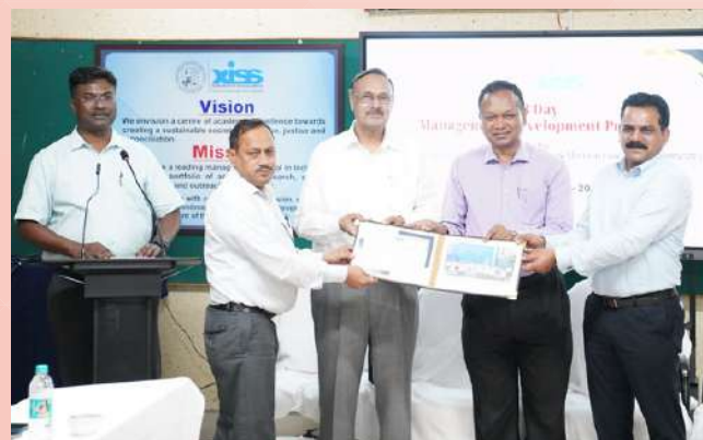
Certificate distribution during the training